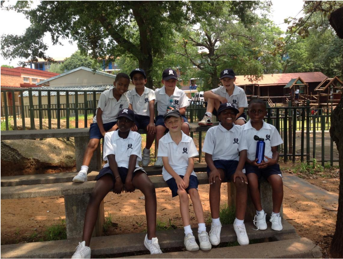
KFC MINI CRICKETERS