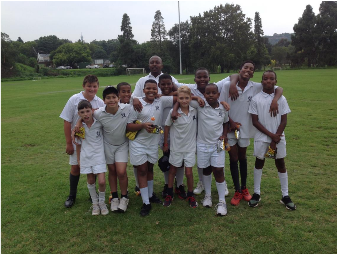
COMMONWEALTH TEAM vs HOUGHTON MUSLIM ACADEMY