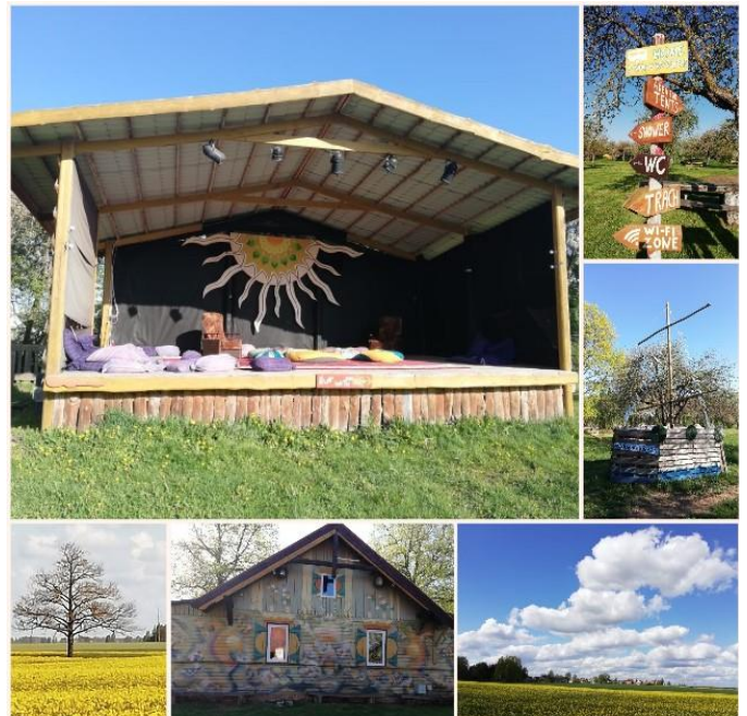
First camp in Latvia